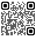
Adult ROL Registration