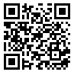
Youth ROL Registration